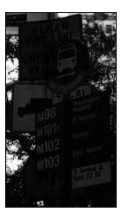
The signposts at Lexington Avenue and East 118<sup>th</sup> Street in Harlem, above left, Third Avenue and East 72<sup>nd</sup> Street on the Upper East Side, above right, and Jamaica Avenue and 147<sup>th</sup> Place in Jamaica, Queens, below left, all block street signage, and are obstructed by this same signage from the opposite side.

The signpost below right is on West 42^{nd} Street near the corner of Ninth Avenue. It was installed in winter too close to a tree. Now that the tree has bloomed, the signpost is all but invisible.