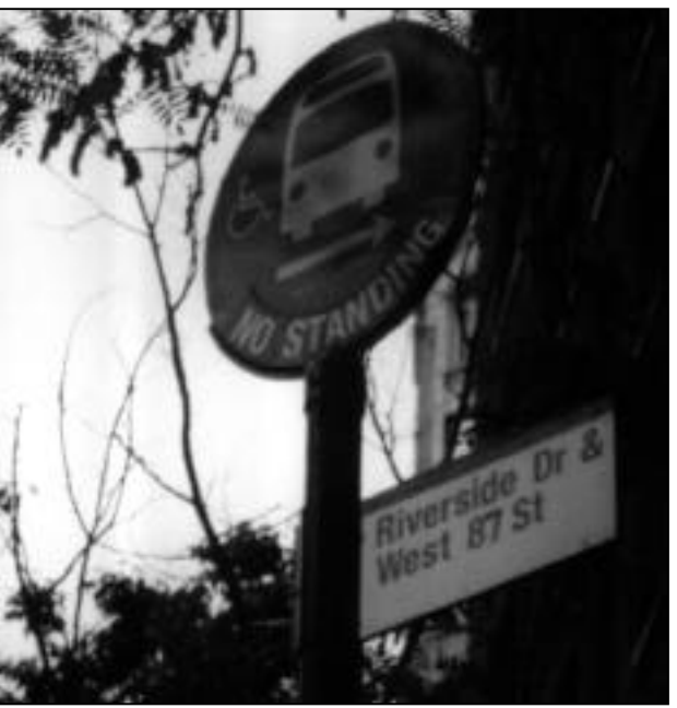
The M5 sign on Riverside Drive , above left, is a Limited route sign, but all service on Riverside Drive is Local. Above right, all route information panels are missing from another M5 Riverside Drive signpost.

Following NYC Transit guidelines, the signpost at Central Park South and Columbus Circle , below left, lists only Limited service at this M5 route Limited stop, thus customers have no way to discern that M5 Local service is available here weekday evenings and weekends. Meanwhile, the signpost at Second Avenue and East 42<sup>nd</sup> Street , below right, incorrectly lists only Local M15 service at a Limited stop served by both types of service.